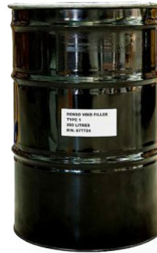
Denso™ Void Filler Type 1

Application Purpose: A blended petrolatum-based compound and additives specifically formulated to repel atmospheric moisture and humidity.