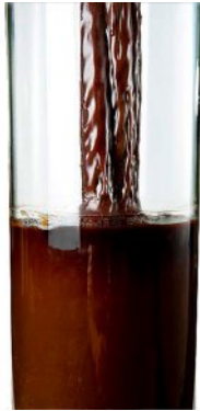
Prestressing strand cable encased in Denso Void Filler

System Purpose: Denso™ Void Filler Type 1 is a petrolatum compound specially formulated for hot injection into voids. The compound is based entirely on petroleum hydrocarbons with additives to displace water, inhibit corrosion, enhance adhesion and control flow.