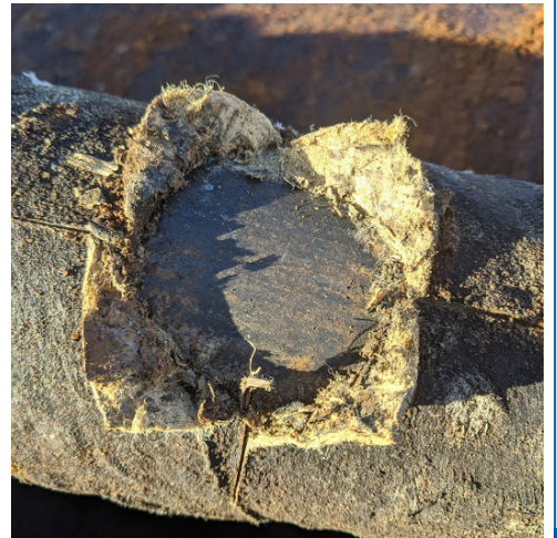
Water main wrapped in Denso™ Tape more than 50 years ago.